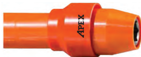
Tool with Gap Cover connection