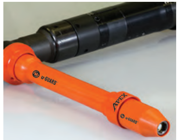
APEX u-GUARD gap cover enhances safety by covering the gap between a socket and an extension