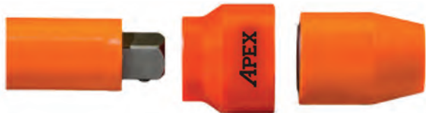
Gap Cover showing connection between the extension and socket.